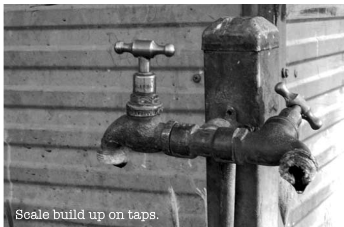
Scale build up on taps.

This BUSH TECH focuses on tips for maintenance of household appliances that are affected by scale build up.