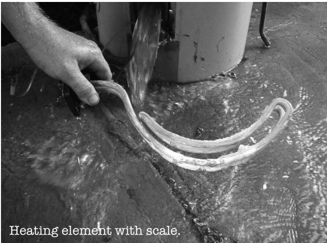
Heating element with scale.

Correct maintenance will make air conditioners last longer and run more efficiently. Regular maintenance will not only prevent scale but will ensure good air hygiene by removing other sediment, fungus or algae.