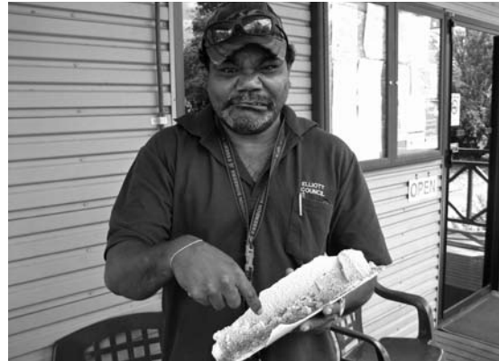
LEFT: Scale build up inside a pipe.

Clear plastic bleed pipes should be used instead of copper ones in hard water areas, as they can be squeezed firmly, or tapped with a rubber mallet and then shaken out to loosen scale. If not cleaned, the bleed pipes can clog and cause the unit to continue to retain water, increasing scale build-up in the air conditioner.